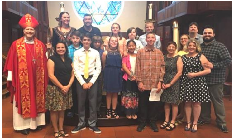
CONFIRMATION AT TRINITY CATHEDRAL SATURDAY MAY 13, 2017