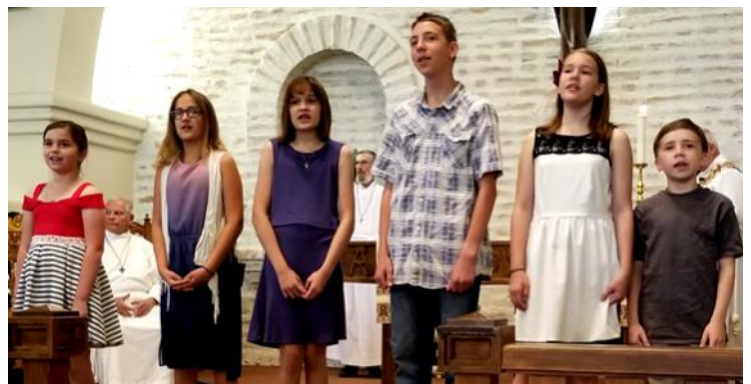
CHORISTERS SINGING AT 9:30 SERVICE SUNDAY, MAY 14, 2017